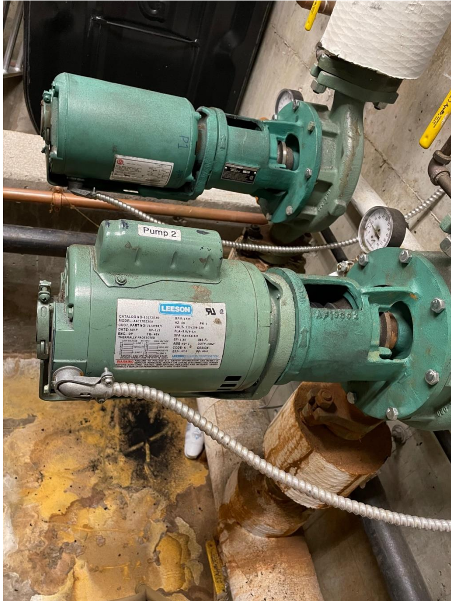
Informational Photo 2: side view of pumps