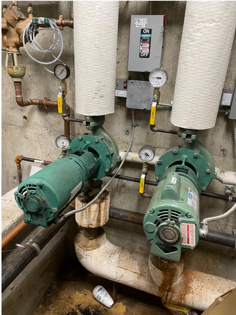
Informational Photo 1: Pump location and electrical switches